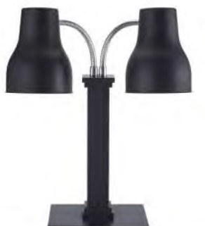
Adjustable Neck Heat Lamps, Double Head