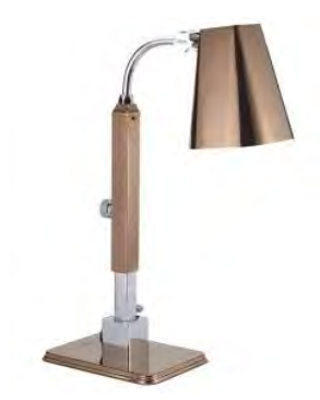
Pivot Head Heat Lamp, Single Head