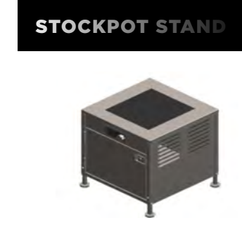
Induction Stockpot Stand, 1800W, 2600W, 3500W