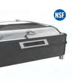
Solstice Dual Hot Cold System