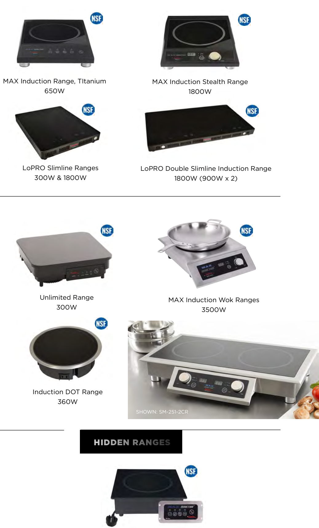
MAX Induction MultiSurface Hidden Induction Range 650W