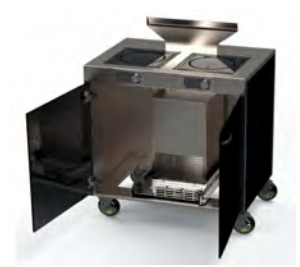
Mobile Induction Cooking Station Double Range