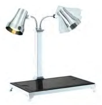
Carving Station, Mocha/ Onyx (heat lamp with unheated board)