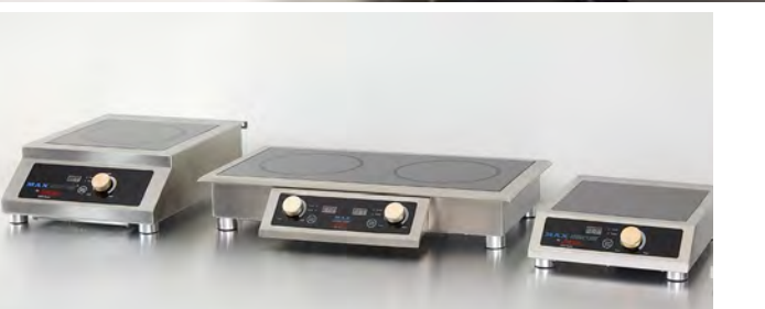
SHOWN: SM-181C, SM-351C, SM-251-2CR