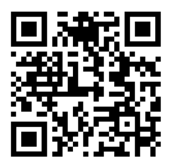
View our entire line of induction-ready buffet servers, scan the QR code.