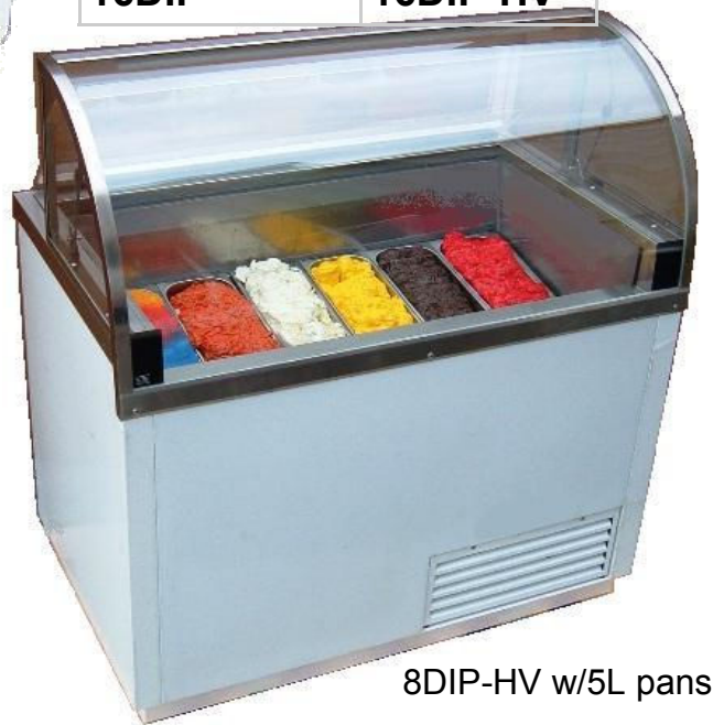
8DIP-HV w/5L pans