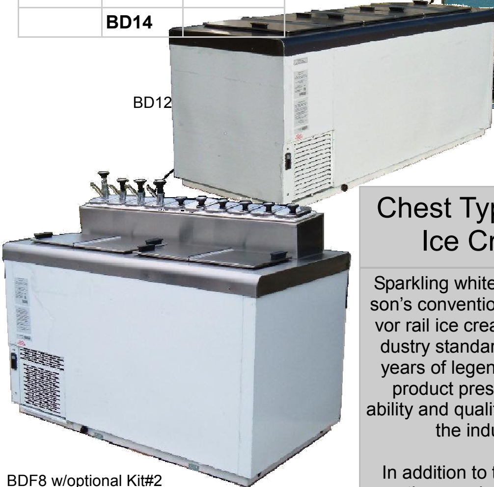
BDF8 w/optional Kit#2