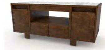
QSC6827 Induction Credenza, 3 hidden ranges