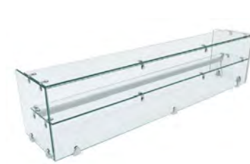
Attendant Service, Multiple Tier