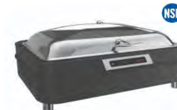
Solstice Dual Hot Cold System