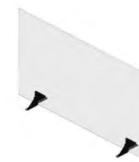
Self-standing Acrylic Shield