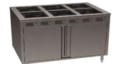
48" 6-zone Induction Cooking Cabinet 1800W, 2600W, 3500W