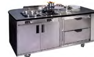
Mobile Culinary Station, 1800W/ 2600W