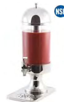
Stainless Steel Juice Dispenser & Drip Tray, 7.4qt