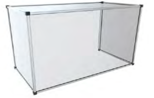
Fully Enclosed, Acrylic