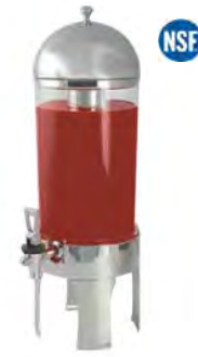
Stainless Steel Juice Dispenser 4.2qt, 7.4qt