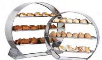
Xcessories Display Wheels