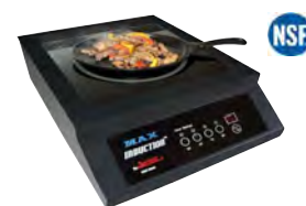
MAX Induction Sizzle Range 3500W