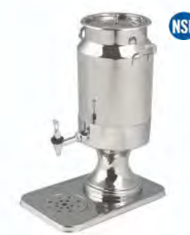
Stainless Steel Milk Dispenser 5.3qt