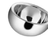
Dobbelt Insulated Bowls