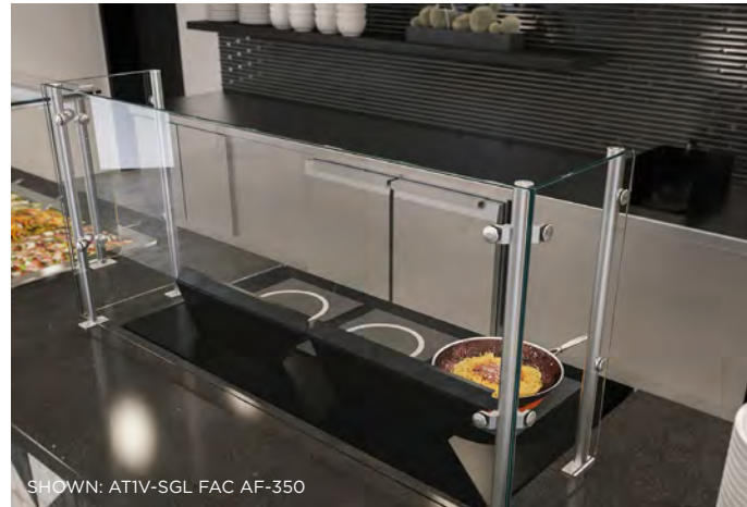
SHOWN: ATIV-SGL FAC AF-350