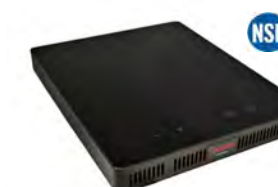
LoPRO Slimline Ranges 300W & 1800W