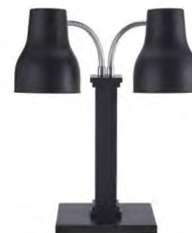
Adjustable Neck Heat Lamps, Double Head