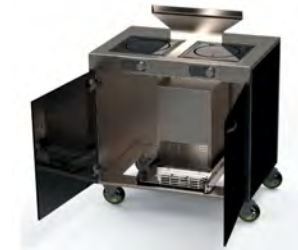
Mobile Induction Cooking Station Double Range