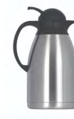
Omega Beverage Server, 20, 34, 52, 68oz.