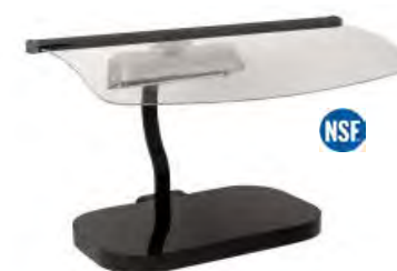
Integra Dual Heat Warming System