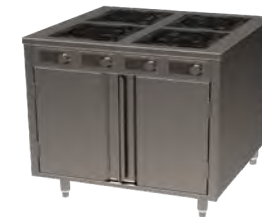
36" 4-zone Induction Cooking Cabinet 1800W, 2600W, 3500W