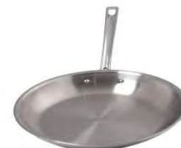
Primo Frying Pans