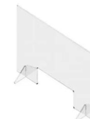
Self-standing Acrylic Shield, Pass-thru Window