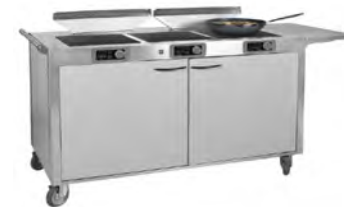
Mobile Induction Cooking Station Triple Range