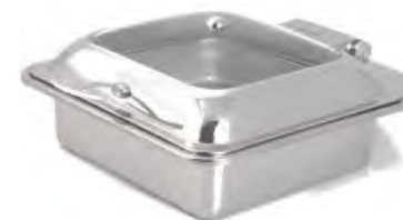
Reflections Server Square Glass