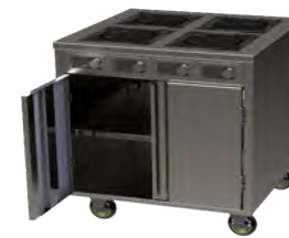
36" 4-zone Induction Cooking Cart 1800W, 2600W, 3500W