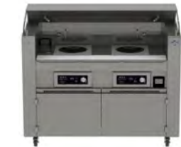
Induction Wok MCS Cooking Station, 7000W