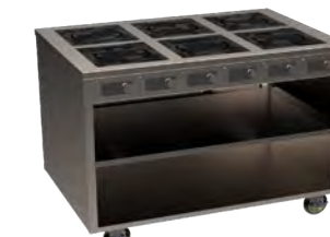
48" 6-zone Induction Cooking Cart 1800W, 2600W, 3500W