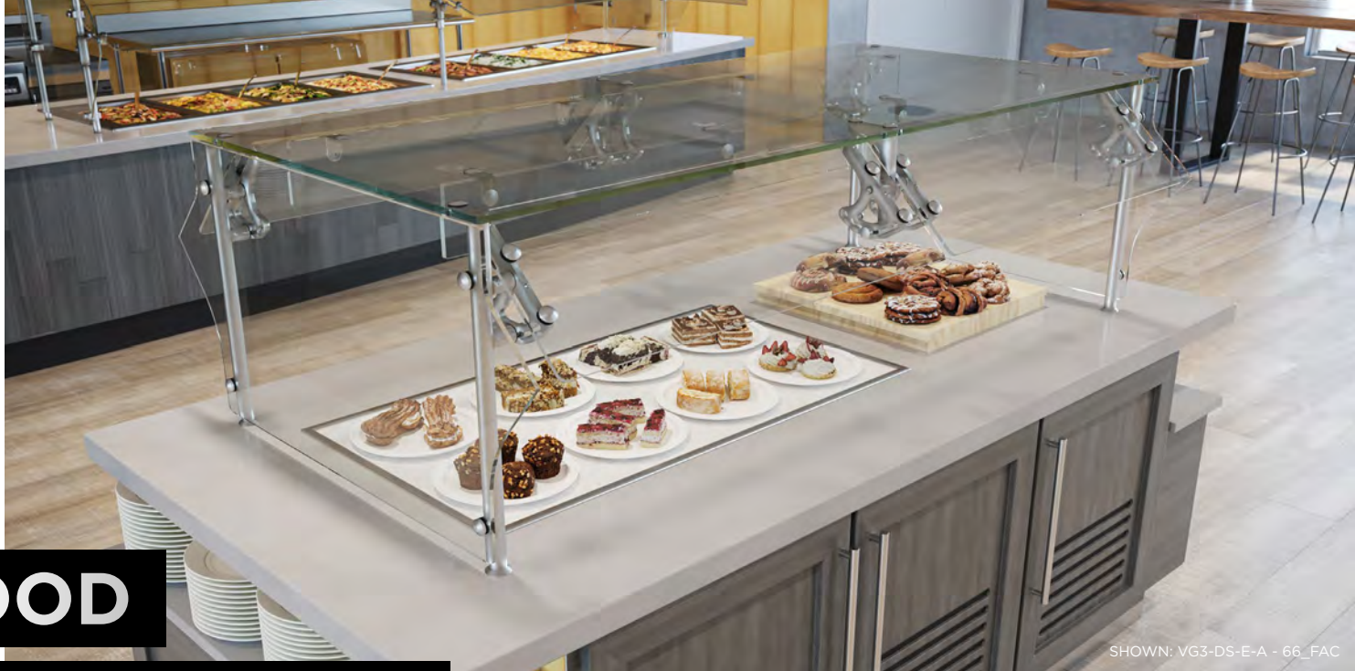
SHOWN: VG3-DS-E-A - 66_FAC