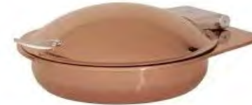
Reflection Servers Rose Gold, Titanium, Stainless Steel