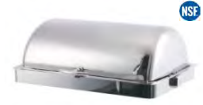
Rondo Built-in Chafer