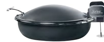
Seasons Servers Merlot, Titanium, Sapphire, Bronze