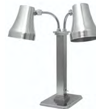
Pivot Head Heat Lamp, Double Head