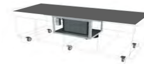
Hidden Frost Top