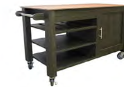
AireServe Mobile Frost Top Serving Cart