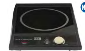
MAX Induction Stealth Range 1800W