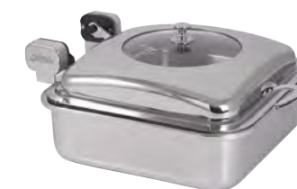
Vision Server Square