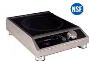
MAX Induction Ranges 1800W - 3500W