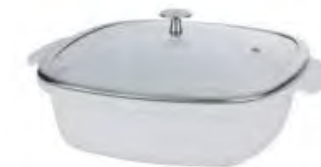
Motif Cook & Serve Ware