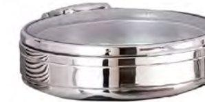
Radiance All Glass Server Stainless Steel, Titanium