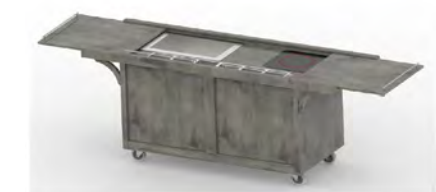
TRC4834 Mobile F&B Induction Serving Cart