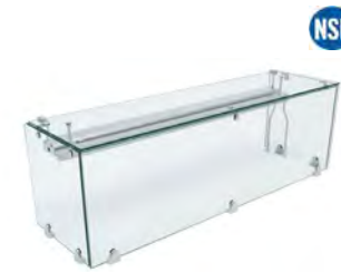
Attendant Service, Single Tier