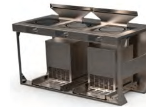
Built-in Induction Cooking Station Triple Range