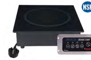
MAX Induction MultiSurface Hidden Induction Range 650W