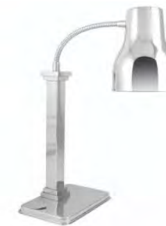
Adjustable Neck Heat Lamps, Single Head