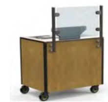
Built-in Guard ICS234