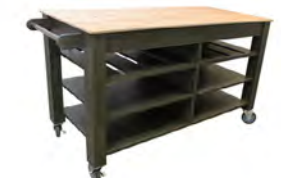
AireServe Mobile Induction Serving Cart