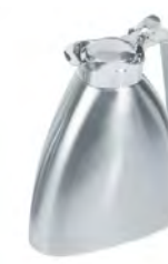
Delta Beverage Server, 14, 24, 34, 52oz.