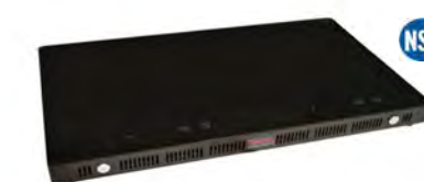
LoPRO Double Slimline Induction Range 1800W (900W x 2)