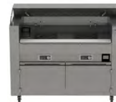
Induction MCS Cooking Station, 5200W 7000W