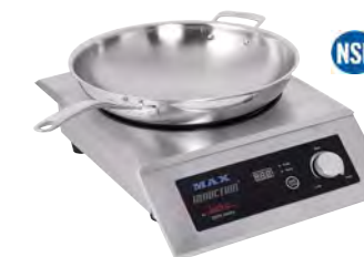
MAX Induction Wok Ranges 3500W