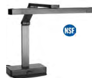
iLume Infrared Heat Lamp, Multi-positioning