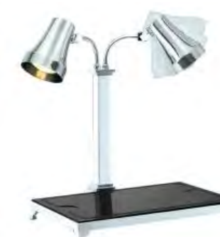
Carving Station, Mocha/ Onyx (heat lamp with unheated board)