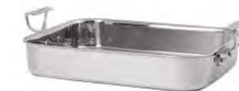
Primo Roasting, Paella, Gratin Pans