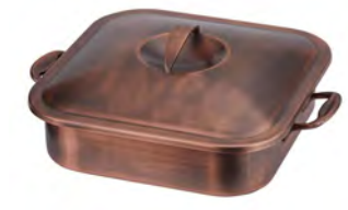
Servella Square/ Rectangle