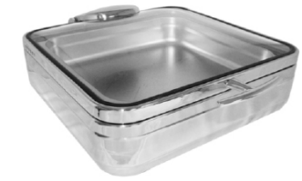
Radiance All Glass Server Stainless Steel, Titanium