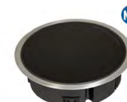
Induction DOT Range 360W