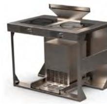
Built-in Induction Cooking Station, Double Range