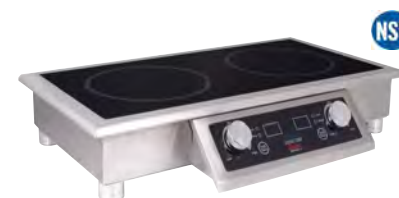
MAX Induction Double Range 2500W