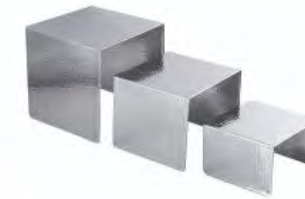
Stair Risers & Riser Sets