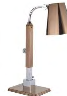
Pivot Head Heat Lamp, Single Head