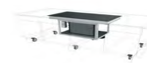
Exposed Frost Top