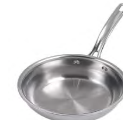
Primo Sauce & Saute Pans