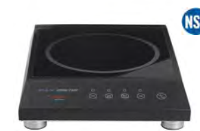
MAX Induction Range, Titanium 650W