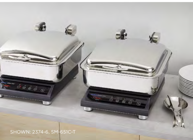
SHOWN: 2374-6, SM-651C-T

Premium buffet servers that offer the best in quality and design for foodservice operations that demand the highest level of performance.