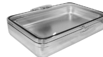
Radiance All Glass Chafer Stainless Steel, Titanium