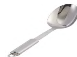
Stainless Steel Utensils