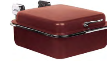
Seasons Server Merlot, Titanium, Sapphire, Bronze