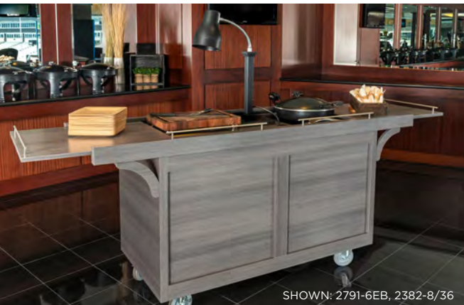
SHOWN: 2791-6EB, 2382-8/36