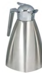
Sigma Beverage Server, Brushed/ Polished Finish