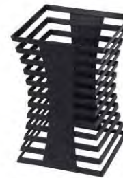
Xcessories Towers, Stainless Steel/ Titanium