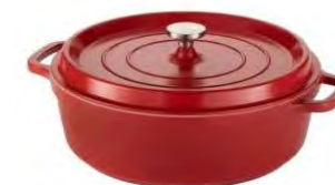
Ironlite Cook & Serve Ware