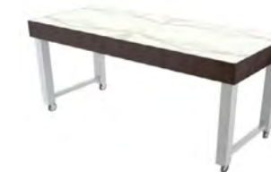
QS7230 Induction Table, 3 hidden ranges