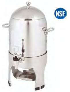
Stainless Steel Coffee Urn, 6qt, 12qt, 20qt