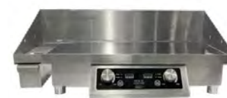
MAX Double Range Griddle Attachment (induction range sold separately)