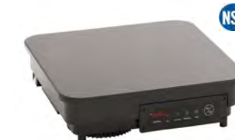
Unlimited Range 300W