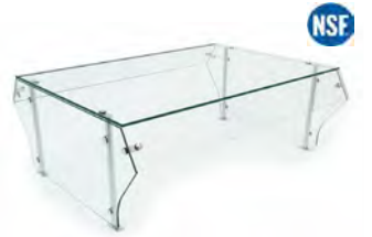
Self Service - Double-sided, Convertible, Adjustable, Fixed