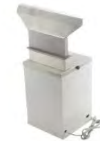
Down Draft Air Filtration System