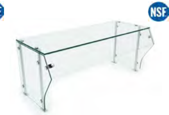
Self Service - Single-sided, Convertible, Adjustable, Fixed