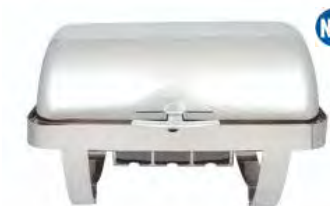
Rondo Classic Chafer