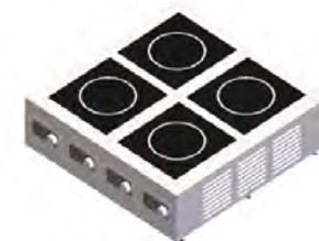
Induction Counter Flat Cooktop, 4-zone, 6-zone