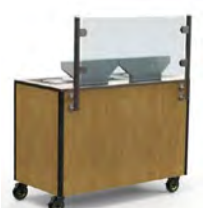
Built-in Guard ICS348

Contact: 800-535-8974 springusa@springusa.com