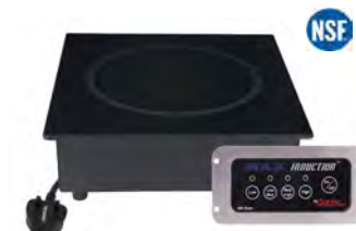
Drop-in MAX Induction Range 650W, 1800W, 2600W