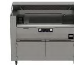
Induction Griddle MCS Cooking Station, 5000W