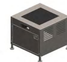
Induction Stockpot Stand, 1800W, 2600W, 3500W